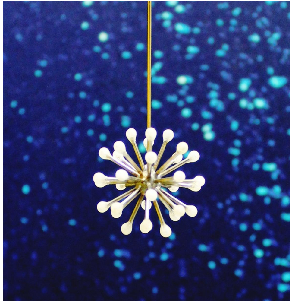
R. Pohlmann and T.J.M. Herbertz: A new instrument for measuring the ultrasonic energy density in liquids. Ultrasonics for Industry Conference papers 1970.