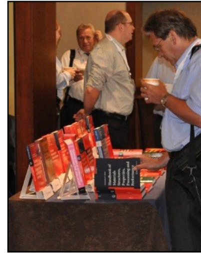
Figure 1. Exhibition display attracting interest from conference attendees