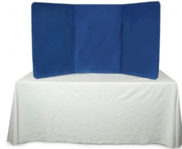
Figure 2. The display table is 6 feet in length and comes with a covered cloth and power. An extra power strip is available at an additional fee.